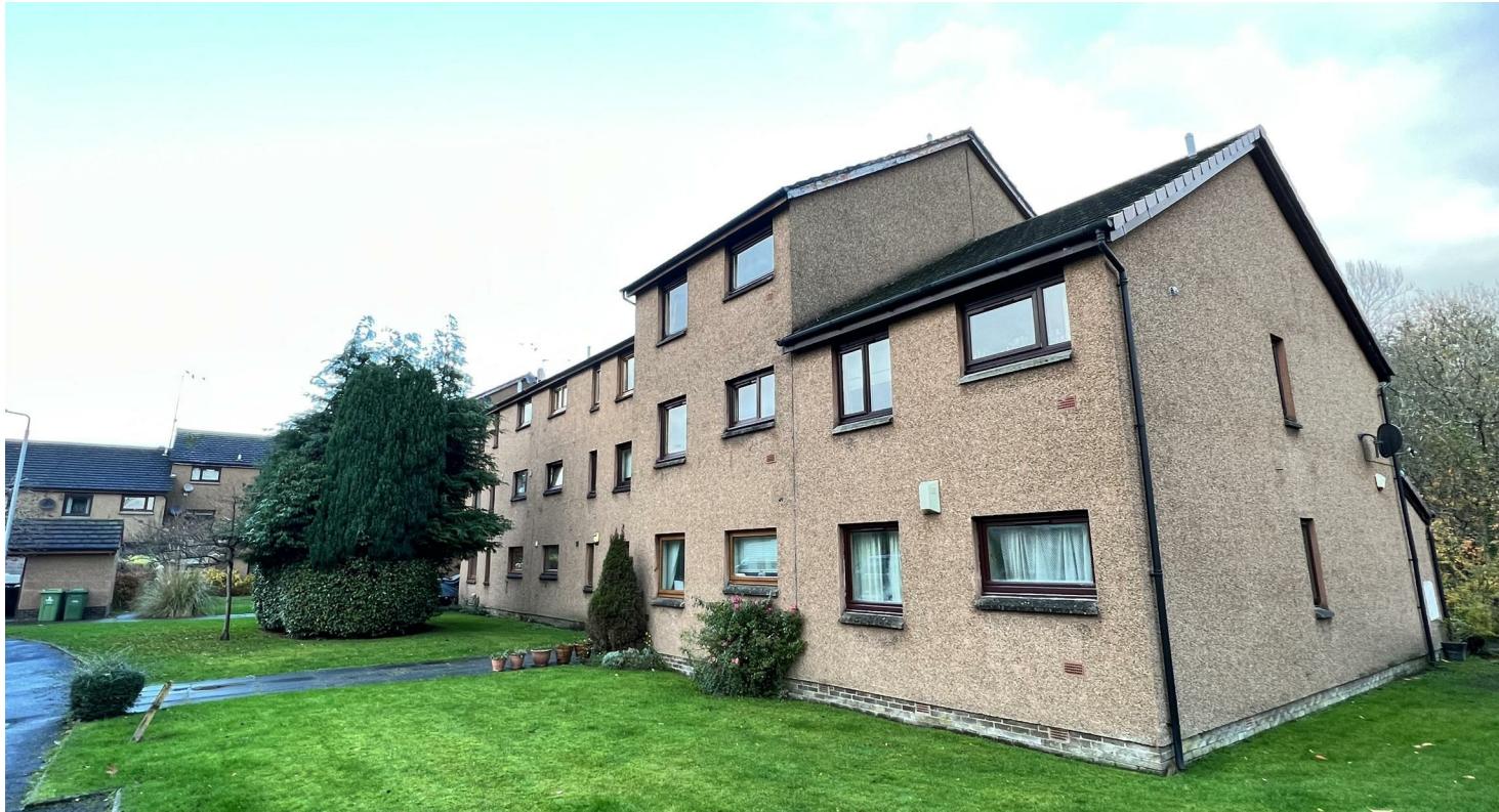
0/1, 6 Fortingall Place, Glasgow, Glasgow, G12 0LT £950 PCM